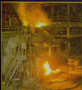
Electric Arc Furnace

Latest generation of EAF steelmaking plants would include an advanced automatic process control systems. The computers monitor and advise the necessary actions to achieve the final condition of the steel. The automation can also include slag detection and tapping mechanism.