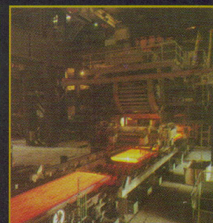
Continuous Casting Machine